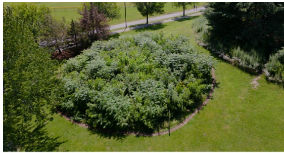
A Miyawaki Forest in Danehy Park, near Harvard University in Cambridge, Mass.

CREATION SPIRITUALITY is about REAWAKENING MYSTICISM & PROTECTING OUR PLANET.