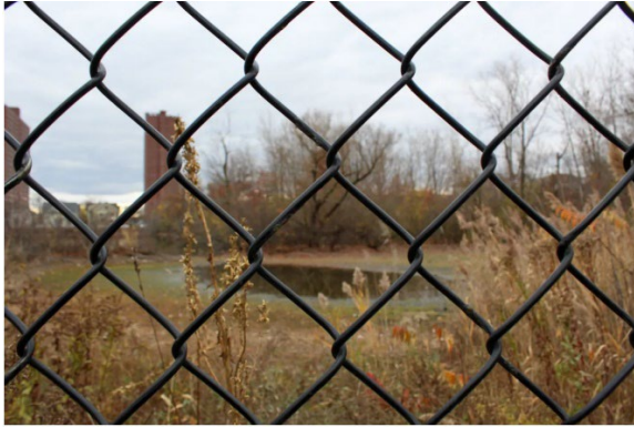
Jerry's Pond, also known as "Jerry's Pit," has been fenced-in and overgrown since 1961.

We're planning art-making activities, invasives wrangling, native garden weeding, a bit of clean-up, Audubon wildlife handling, entertainment by Bengali dancers, a honk band, and an ice cream truck! We'll have tabling with updates on IQHQ's reopening of the pond to public access, a proposed "EcoCenter," plans for Community Garden, and other great proposals.