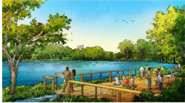
IQHQ, the owner of Jerry's Pit in North Cambridge, announced its intention to remediate and restore the land as open space for public use.